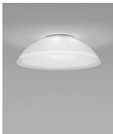
INFIN PL 80