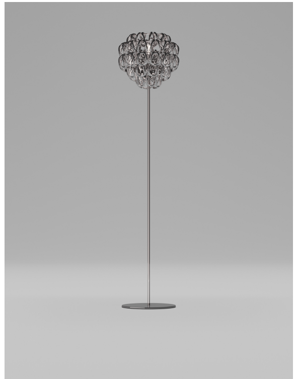
GIOGA PT CRNN CR E27 CE 1