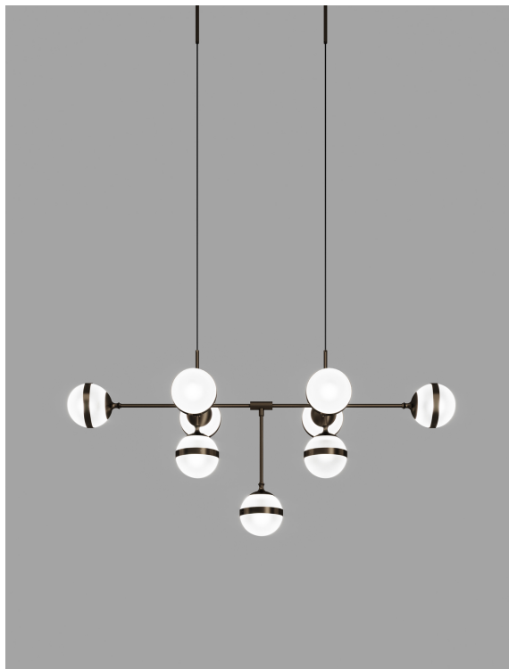
PEGGY SP 9 BCLU OT E14 CE