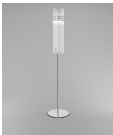
DIADE PT C M