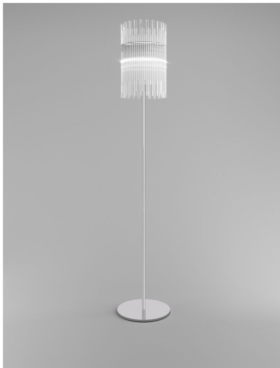
DIADE PT B G CR CR G9 CE