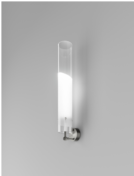
LIO AP 48 CRBC NI E27 CE