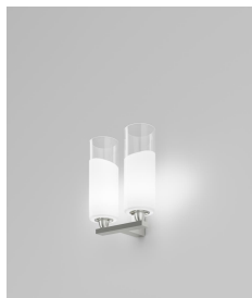
LIO AP L2 P