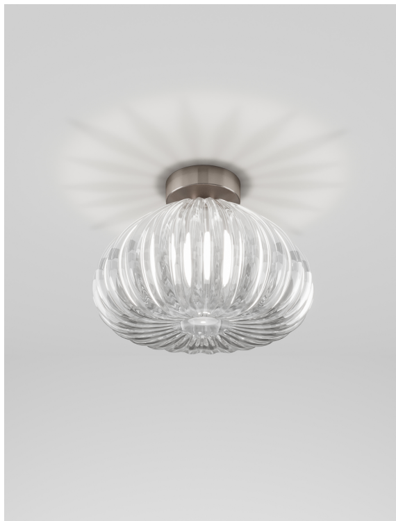
DIAMA PL G CR NI E27 CE