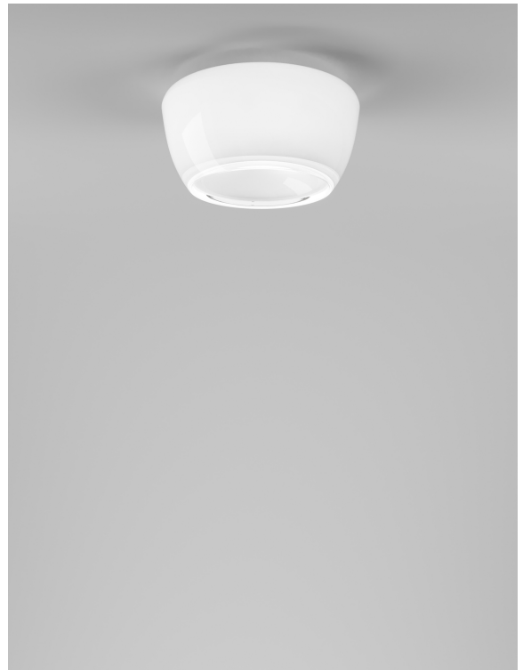
IMPLO PL 50 BCCR BC E27 CE