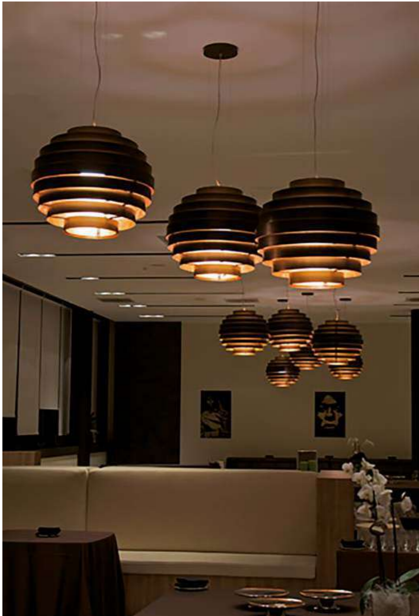
12 Mamamia/Hotel Hilton Green Milan