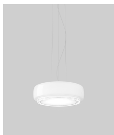
BOT SP 45