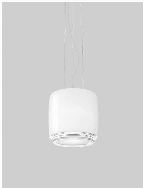
BOT SP 35 BCCR BC E27 CE