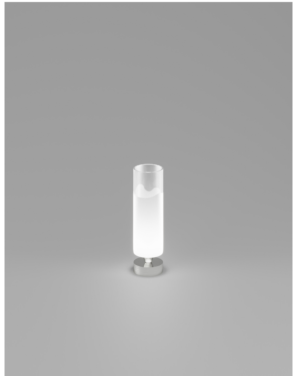
LIO LT P CRBC NI G9 CE