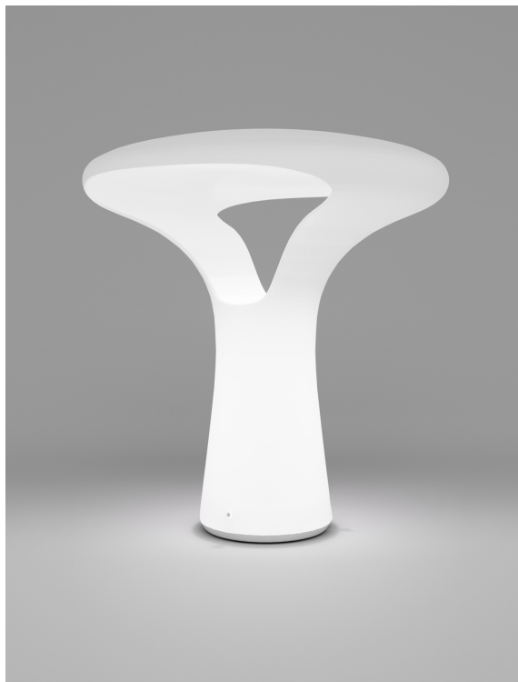
FEREA LT BCST BC E27 CE