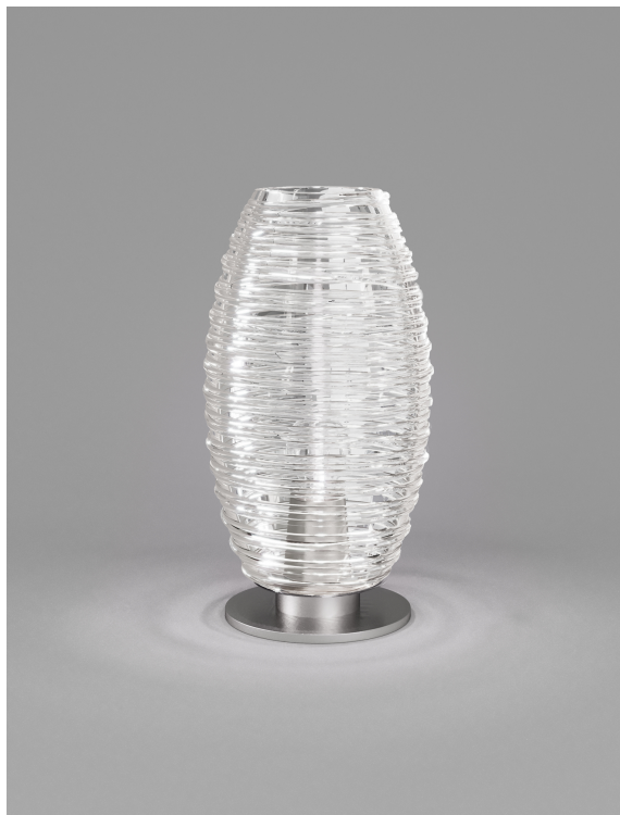
DAMAS LT G CRCR NI E27 CE