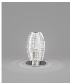
DAMAS LT M