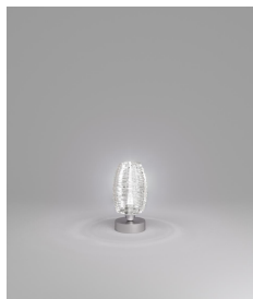
DAMAS LT P