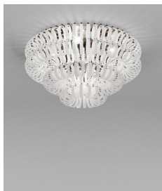
ECOS PL 90