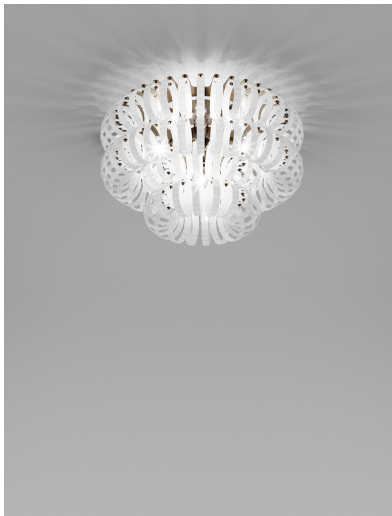
ECOS PL 60A BCRI BS E27 CE