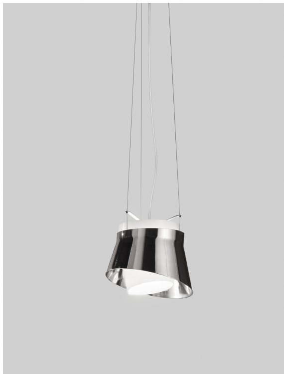
ARIA SP BCCM NL E27 CE