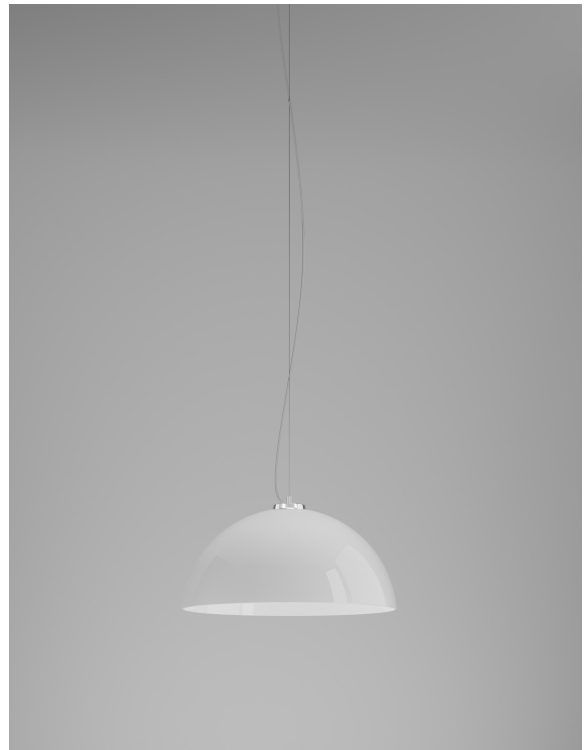
DRESS SP G BCLU CR E27 CE