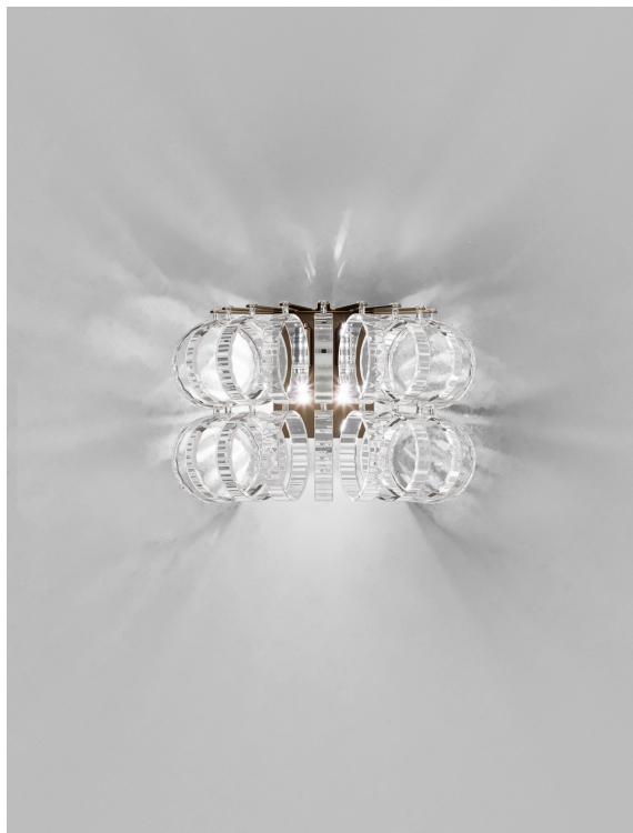
ECOS AP 35 CRRI BS G9 CE