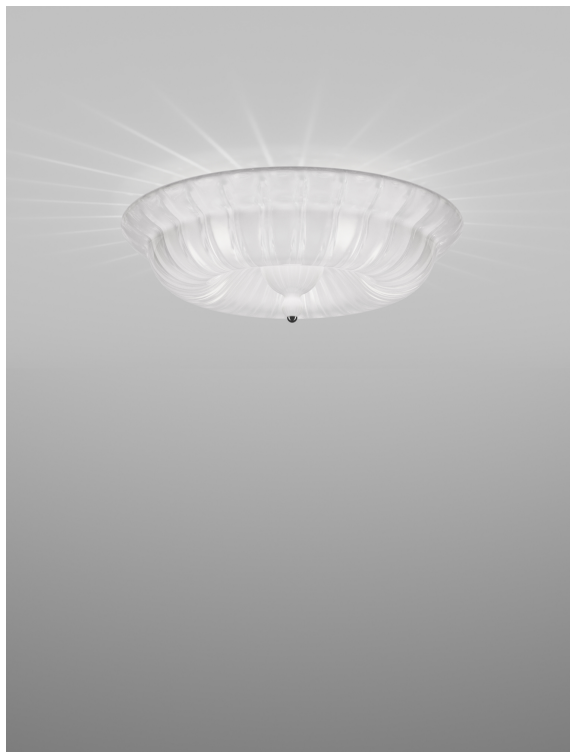
NOVEC PL BCRI CR 14E CE