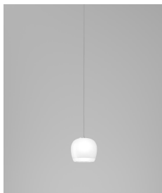
IMPLO SP 16