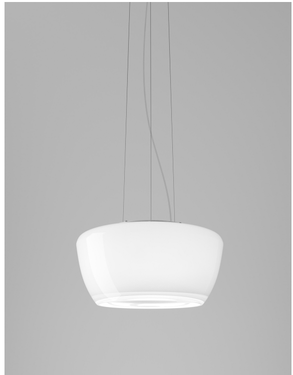
IMPLO SP 50 BCCR BC E27 CE