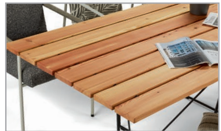
Choice of different outdoor woods