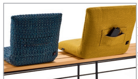
Optionally functional cushion or heatable functional cushion - hotfrog (Powerbank not included in scope of delivery)