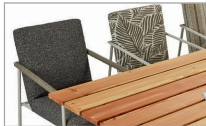
Optional metal base frame with or without wrapped armrest