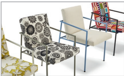
Base frame optionally available in 4 colours