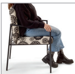
Loosely inserted seat cushion offers an individual sitting comfort