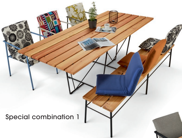
Special combination 1