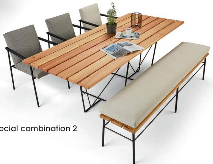
Special combination 2