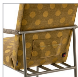
Optionally hotfrog: heatable chair cushion