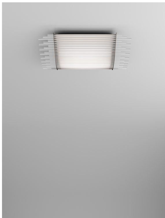
DIADE PL 80 CR BS AL CE