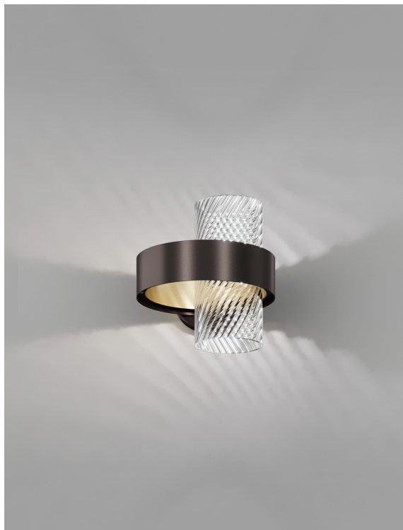
ARMON AP 25 CRRI N_O G9 CE