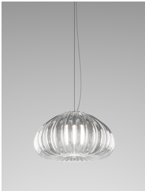
DIAMA SP G CR NI E27 CE