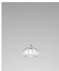
DIAMA SP P