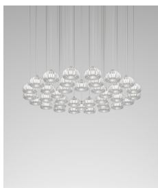
DIAMA SP 36