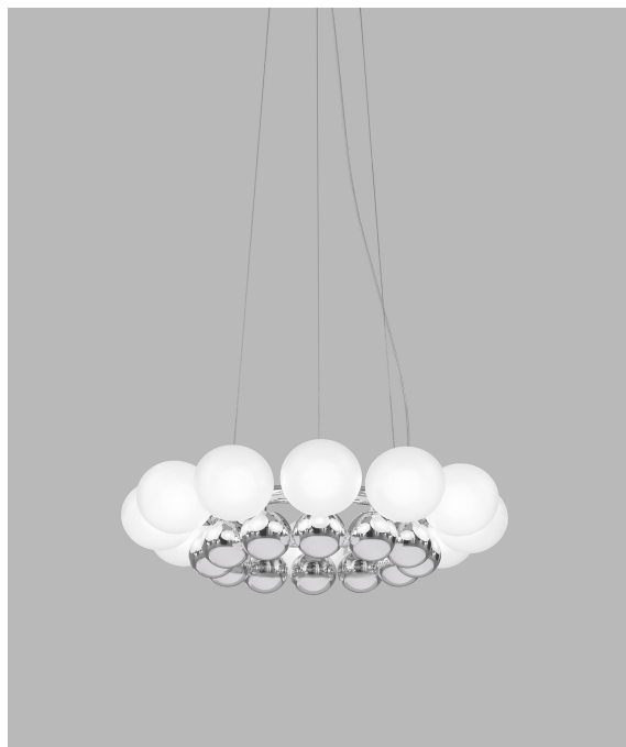
24PEA SP BCCM CR G9 CE