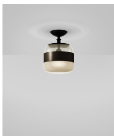
FUTUR PL P