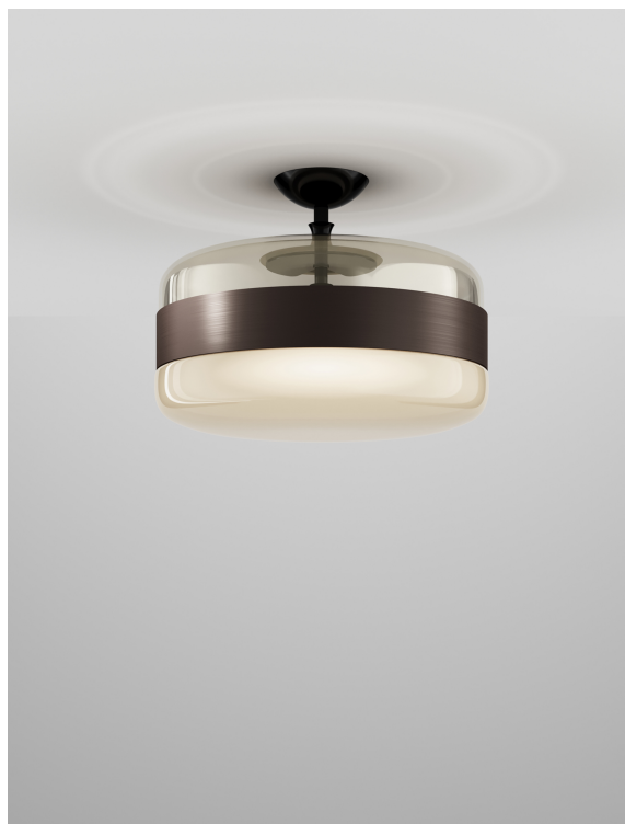
FUTUR PL G AMOT NE E27 CE