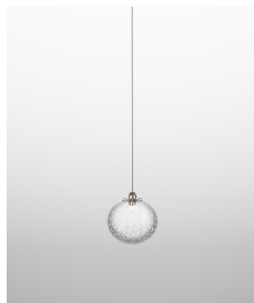
BOLLE SP P