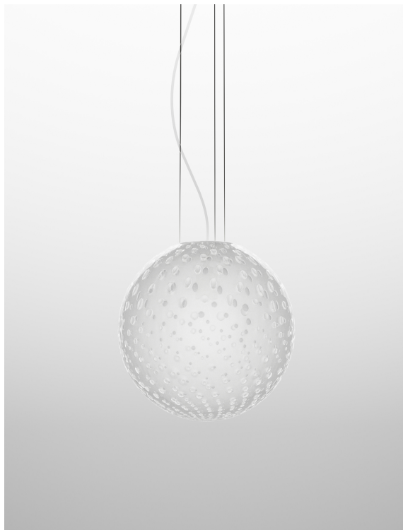
BOLLE SP 35 BCBO NI E27 CE