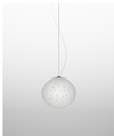
BOLLE SP G