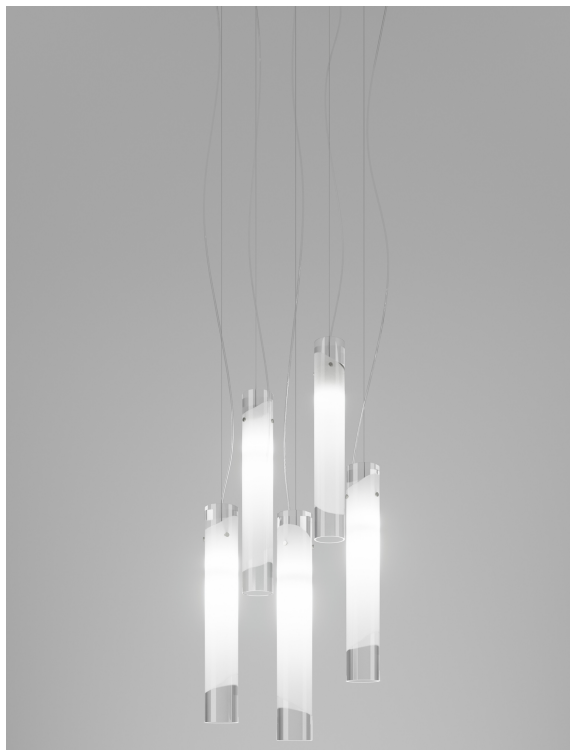
LIO SP 5 CRBC NI E27 CE