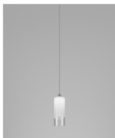
LIO SP 1 P