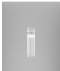
DIADE SP C M