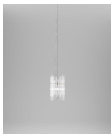
DIAD SP A M