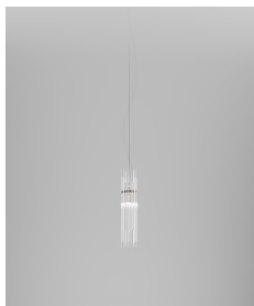
DIADE SP B P