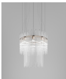
DIAD SP 60 B