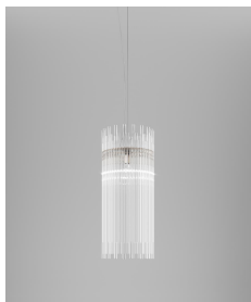
DIADE SP C G