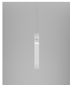
DIADE SP C P