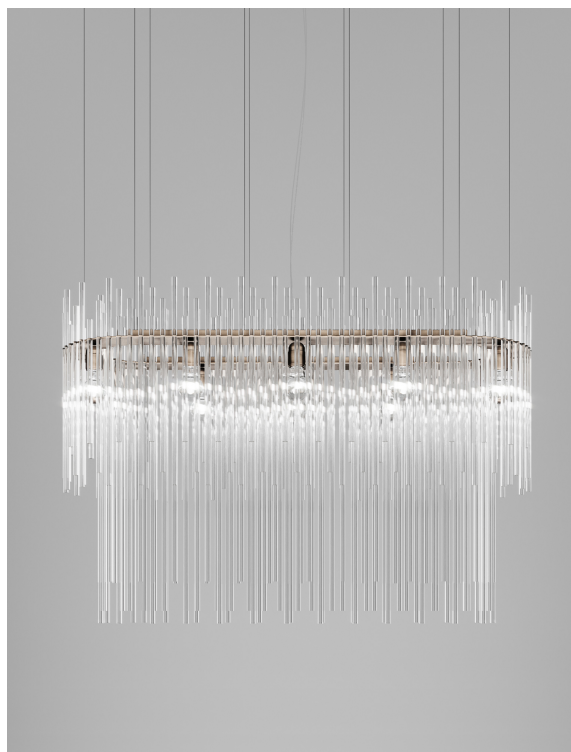
DIAD SP O2 CR BS E27 CE