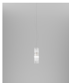
DIAD SP A P