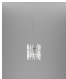
DIAD SP A G