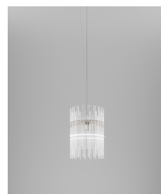
DIAD SP B G