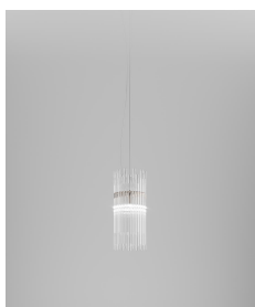
DIADE SP B M