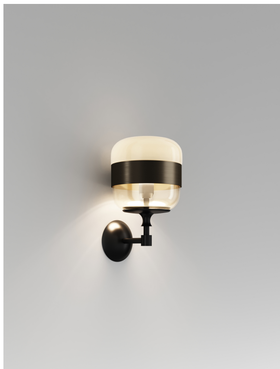
FUTUR AP P AMOT NE E27 CE