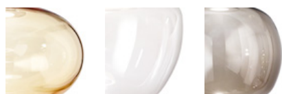
AMTR CRTR FUTR