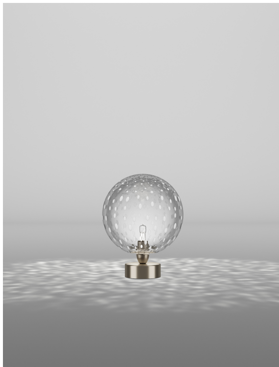
BOLLE LT P CRBO NI G9 CE