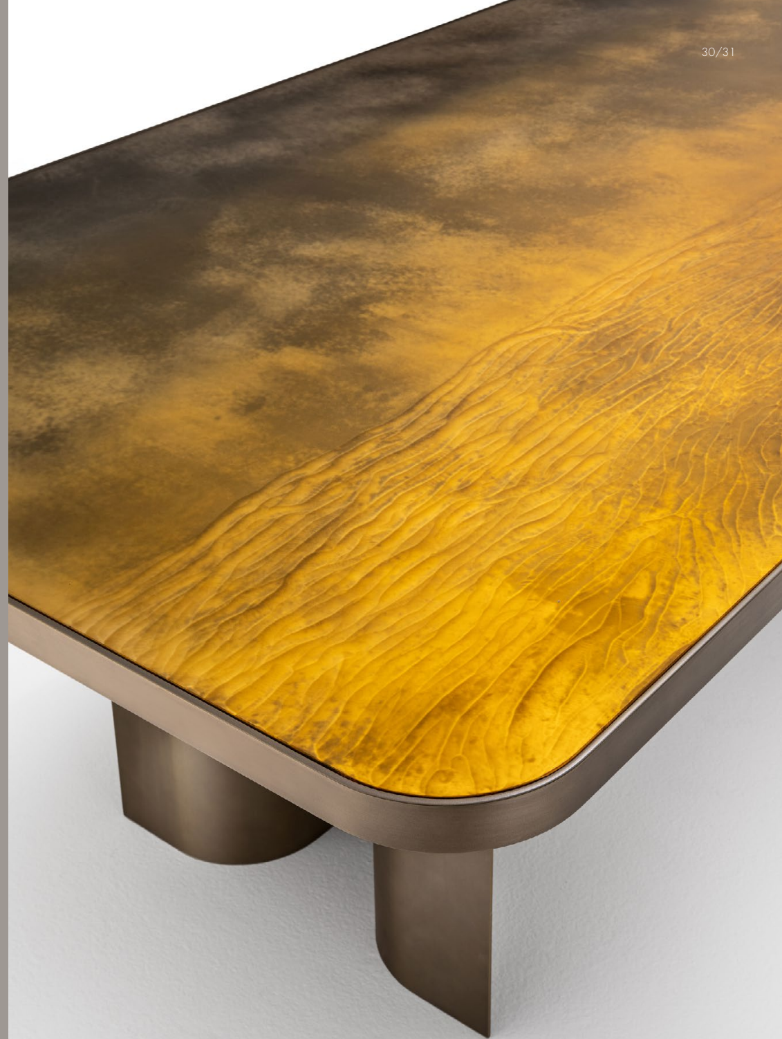
Table / W 300 cm, D 120 cm, H 76 cm metal structure finished in burnished brass, glass top decorated with Gargano finish