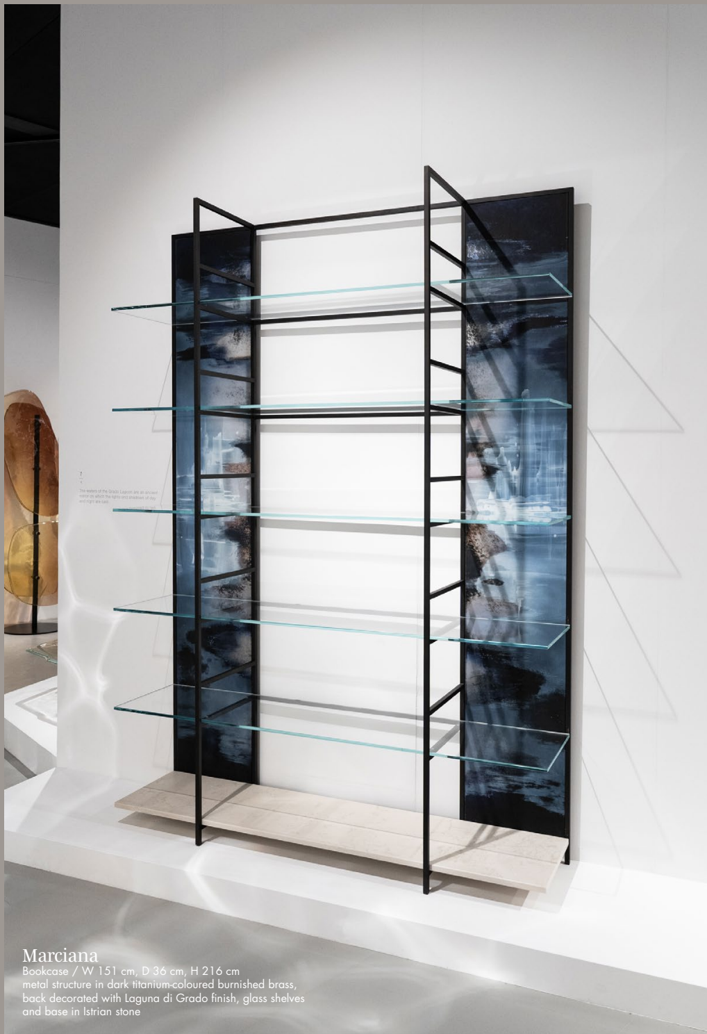
Marciana Bookcase / W 151 cm, D 36 cm, H 216 cm metal structure in dark titanium-coloured burnished brass, back decorated with Laguna di Grado finish, glass shelves and base in Istrian stone