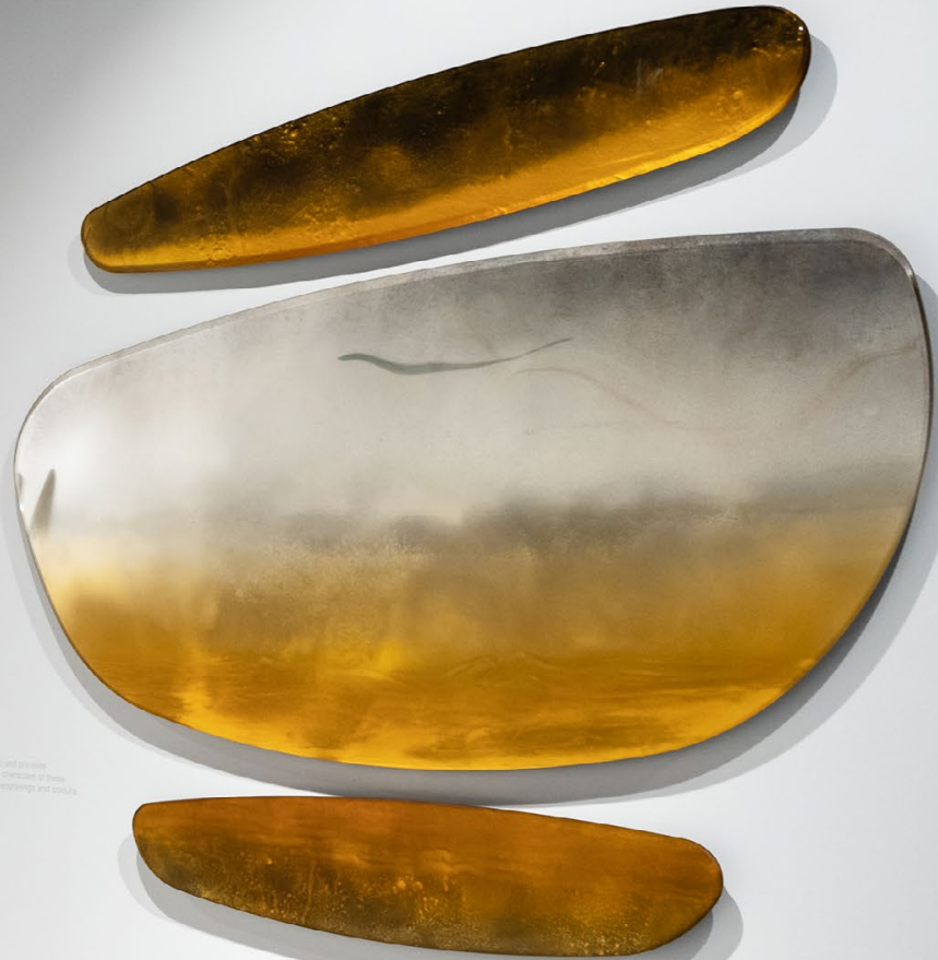
The design is a study of natural and artificial materials. The large panels are made of stone and wood, with a focus on texture and color.