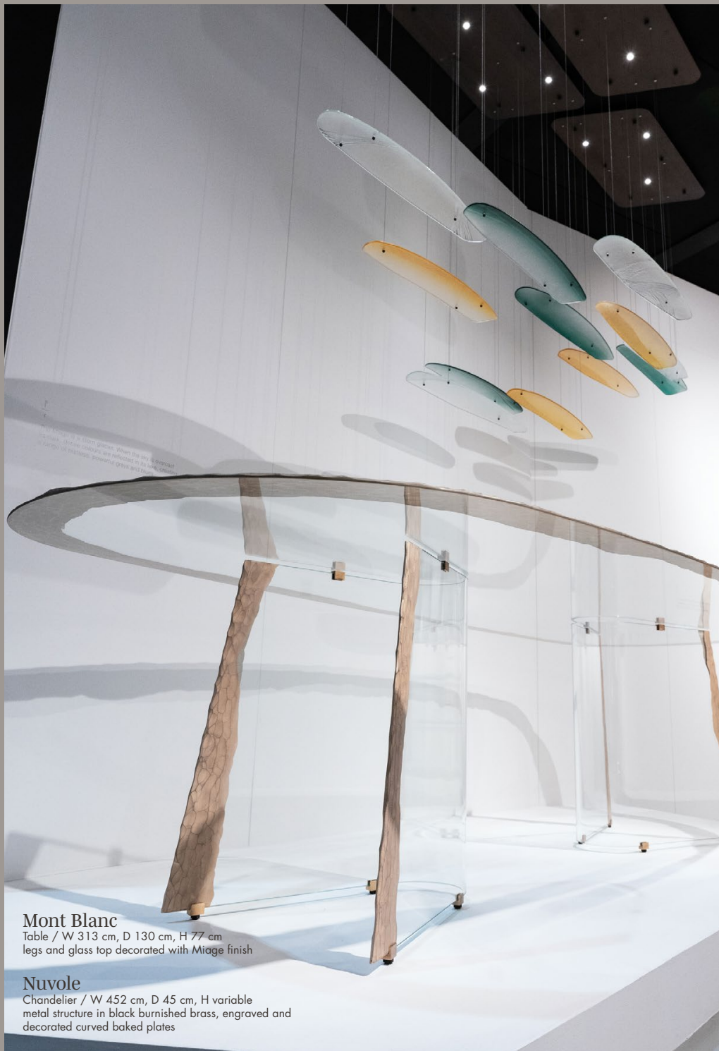
Mont Blanc Table / W 313 cm, D 130 cm, H 77 cm legs and glass top decorated with Miage finish