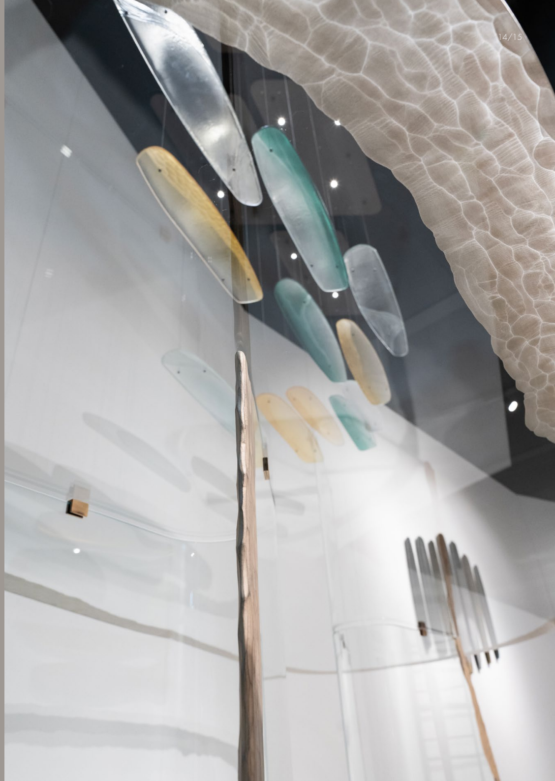
Nuvole Chandelier / W 452 cm, D 45 cm, H variable metal structure in black burnished brass, engraved and decorated curved baked plates