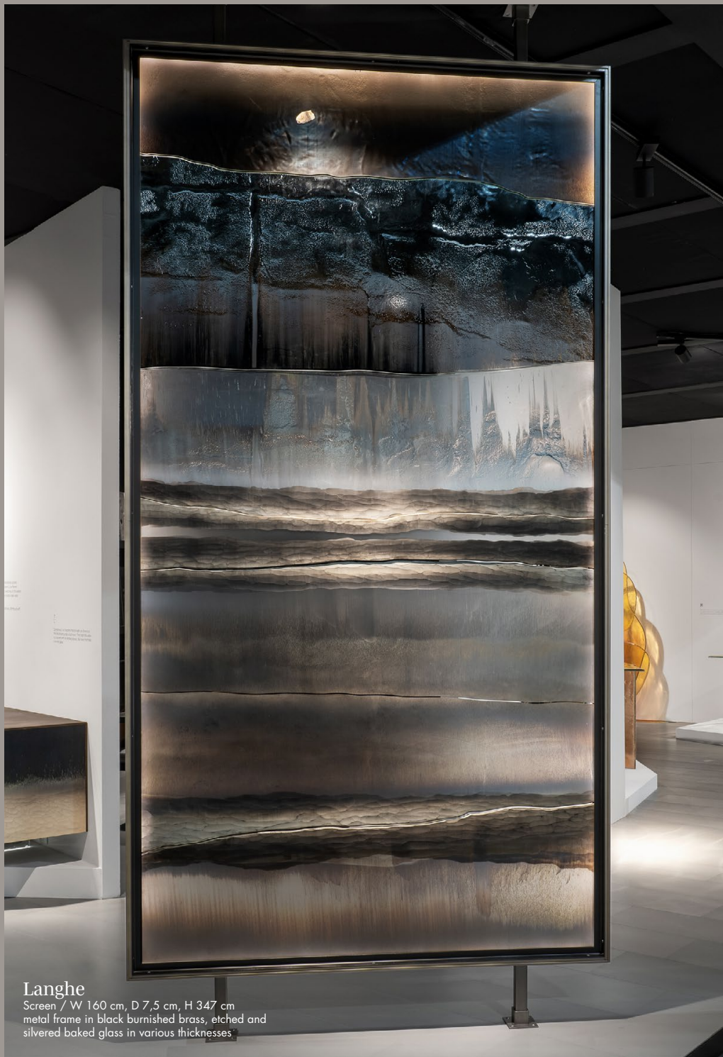
Langhe Screen / W 160 cm, D 7,5 cm, H 347 cm metal frame in black burnished brass, etched and silvered baked glass in various thicknesses