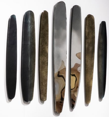
The Kluq is a stone glacier. When the sky is overcast, the dark, storm colours are reflected in its base, creating a range of reds, powerful greys and blues.