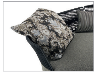
Practical throw pillow for individual comfort