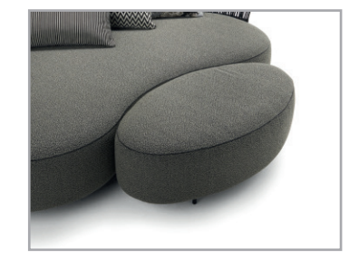
A practical stool adapted to the sofa