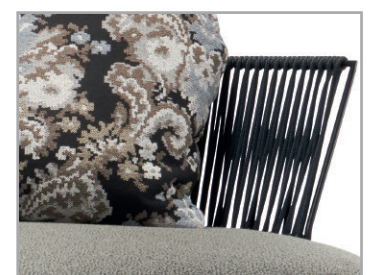
Braided back, available in "nature" or "black"

For general informations please refer to the information about outdoor furniture! Bullfrog recommends the suitable waterproofed protective covers for outdoor furnitures.